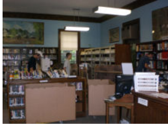
Movers bring in new shelving for 7000 more books at East Milton Branch – June 2007

Half of the main library books were added to the children's collection. You will find a full-service children's room with lots more programming, including storytimes for children.