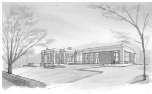
View of the Proposed Library Expansion

Monday 1 – 5:30, 6:30 – 9 (Revised as of Nov. 1!) Tuesday & Thursday 1 – 5:30 Wednesday Closed Friday 9 – 12, 1 – 5:30 Saturday & Sunday Closed